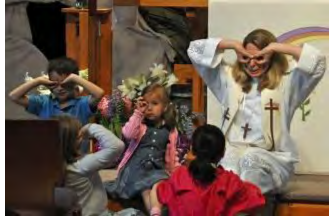
Putting on Our God Goggles