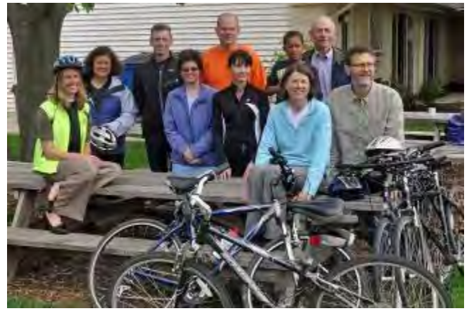
Ride Your Bike to Church Day