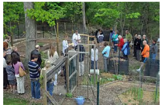
Creation Care Carnival