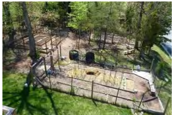
Fruitful Fields, at the beginning of the growing season. An "after" photo will be in an upcoming issue.